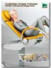
Gynaecology, Urology and Proctology The perfect equipment to meet all requirements