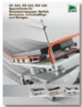
STL 285, STS 282, STX 280 The Patient Transport Systems for Emergencies, Outpatient Depts, Intensive Care and X-Ray