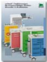
varimed® Special trolleys customized for hospital requirements