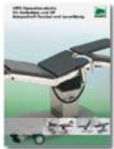
OPX Operating Tables for Outpatient Departments and Operating Theatres Unique Flexibility and Reliability