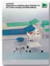
varimed® Medical Furniture for Examination and Treatment Areas