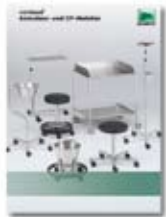
varimed® Furniture for OR theatres and outpatient departments