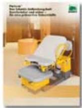
Partura® The Schmitz delivery table comfortable and safe delivery – with focus on preventive obstetrics